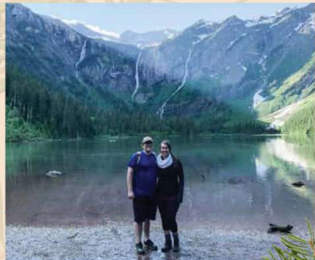
Glacier National Park