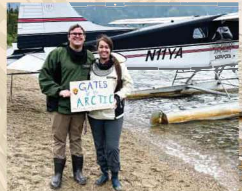
Gates of the Arctic Park, Alaska