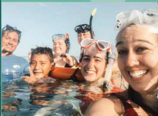
Snorkeling in Belize