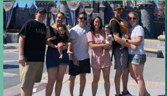
Disneyland group trip with kids