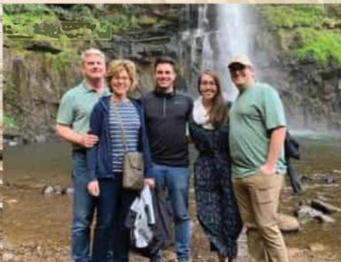
Lone Creek Falls, South Africa