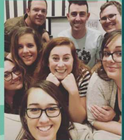
Our annual Friendsgiving