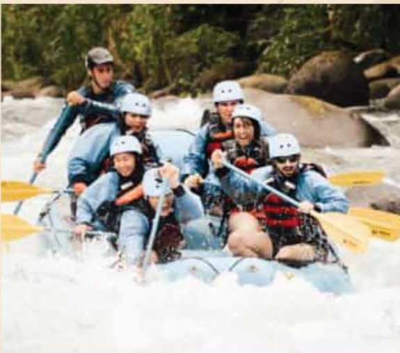
White-water rafting in Costa Rica