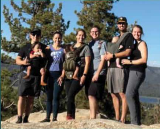
Hiking with kids to the mountains