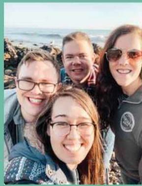
Camping in Malibu