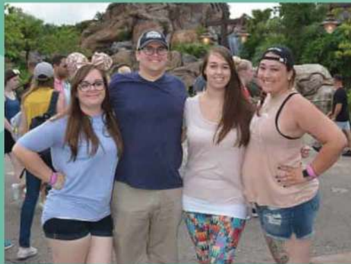
Walt Disney World trip with friends