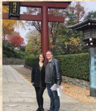
Nezu-Jingu Shrine, Tokyo