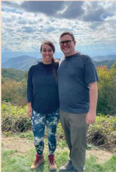
Blue Ridge Parkway, N. Carolina